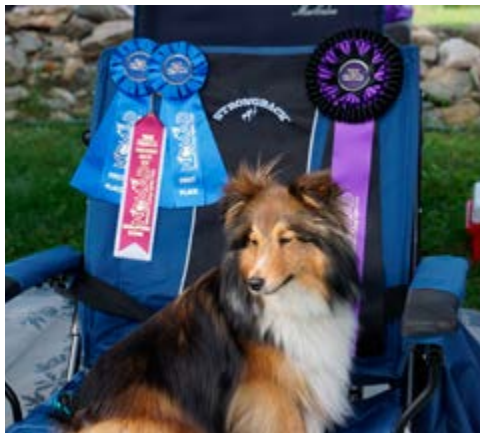
Rally, one of the winners of the Katy Schultz Award

Starters Standard - 14 Inch _____ 1st Starters Pairs - 14 Inch _____ Q 1st (first pairs ever) Starters Gamblers - 14 Inch _____ 1st Place Starters Standard - 14 Inch _____ 1st Place Starters Jumpers - 14 Inch _____ 1st Place