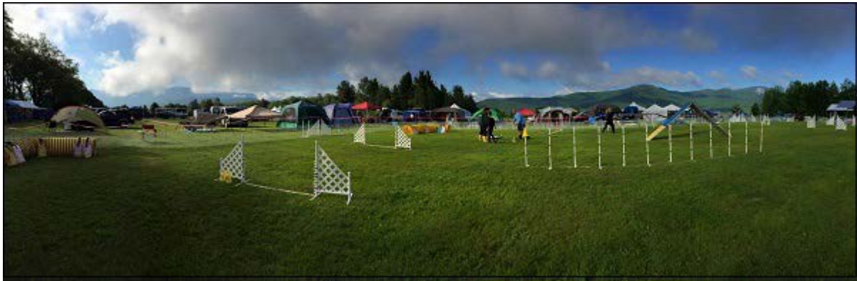
Course building in the clouds.