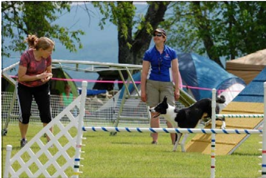
Smiles all around!