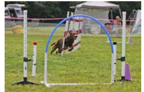
Moxie Falls PQ, Ran as fast as she could in the ring, got all contacts, and all weave poles.