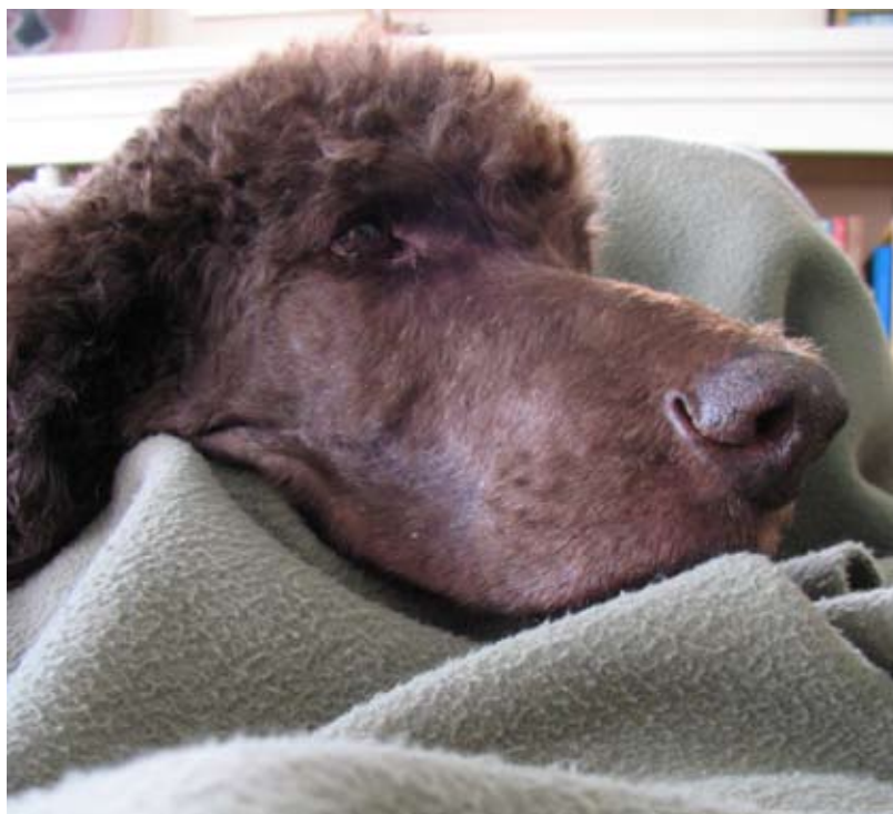
Shelby, the Shnoz

O.K. I warned you. Send me photos or this silliness will continue..