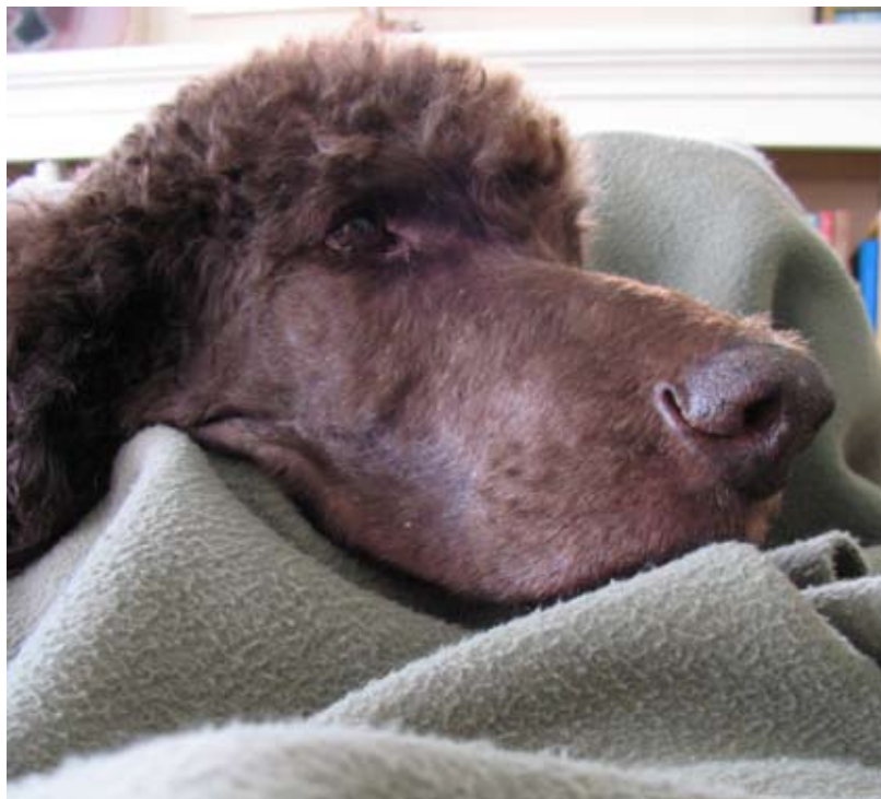
Shelby, the Shnoz

O.K. I warned you. Send me photos or this silliness will continue..