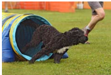
Tux at NAE NADAC